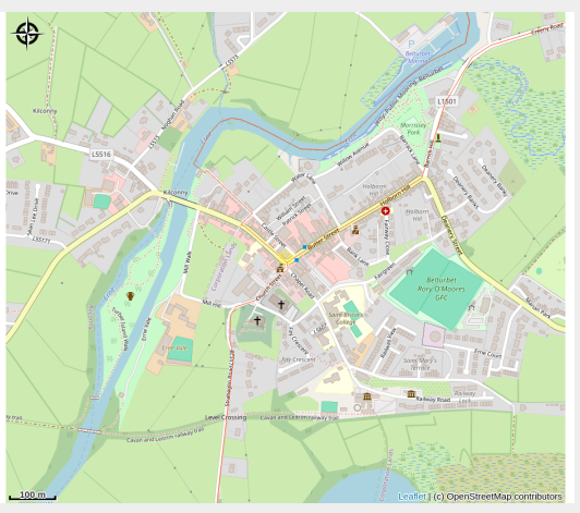
Attribution : Belturbet