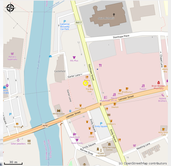
Attribution : (david.ward-perkins)