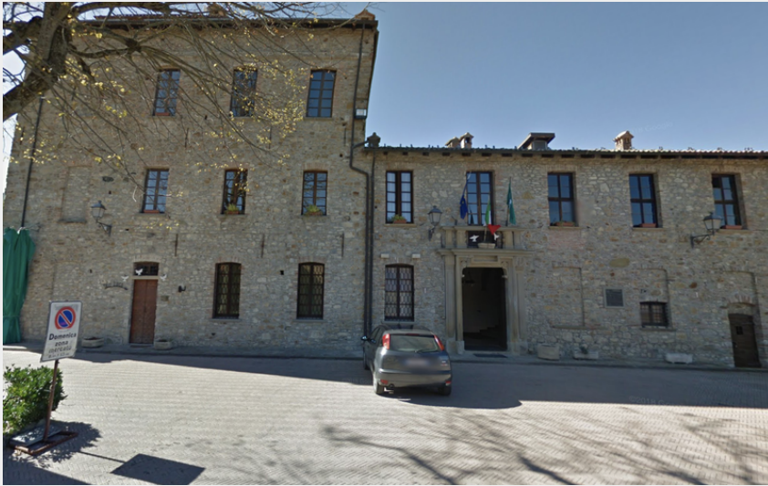
Attribution : Comune di Romagnese