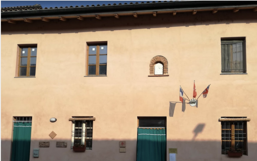
Attribution : Ostello Ad Padum