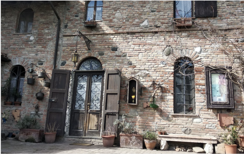
Attribution : Caupona Sigerico