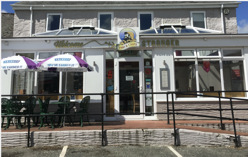
Attribution : Welcome Stranger