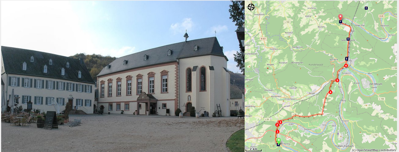
Abbaye de Machtern (Amis de saint Coloman)

A landscape of vineyards and forests in the heart of the beautiful Moselle landscape, halfway between Trier and Koblenz.