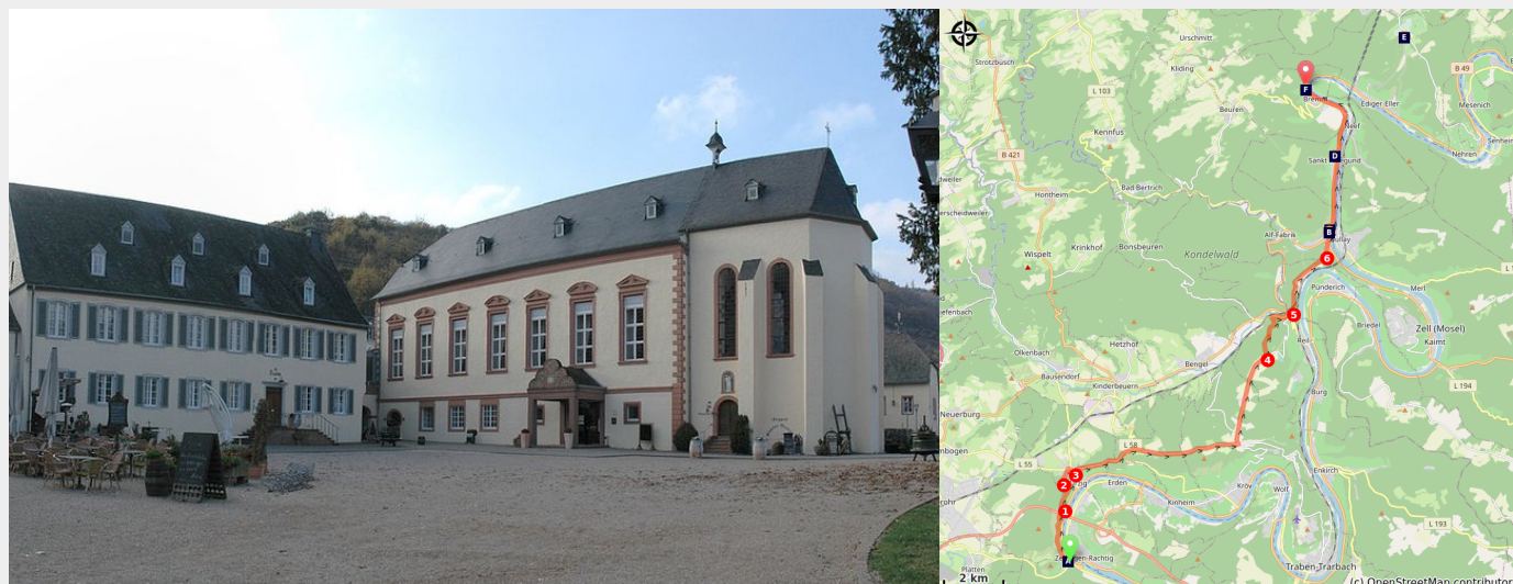
Abbaye de Machtern (Amis de saint Colomban)

A landscape of vineyards and forests in the heart of the beautiful Moselle landscape, halfway between Trier and Koblenz.