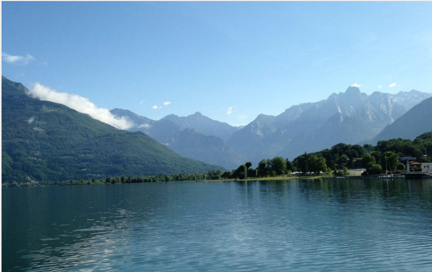
lac de Côme (Amis St Colomban)