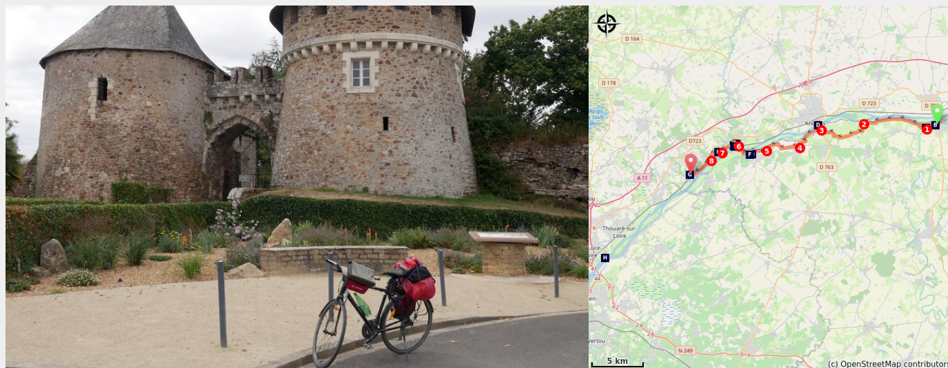
Porte de l'ancienne ville et du château de Champptoceaux (Amis saint Colomban)

A long stage on the banks of the Loire with its bocages and the dead arms of the river which regulate the flow volume of the main channel. Carry out this stage over two days to take advantage of visiting the heritage which is offered to your curiosity.