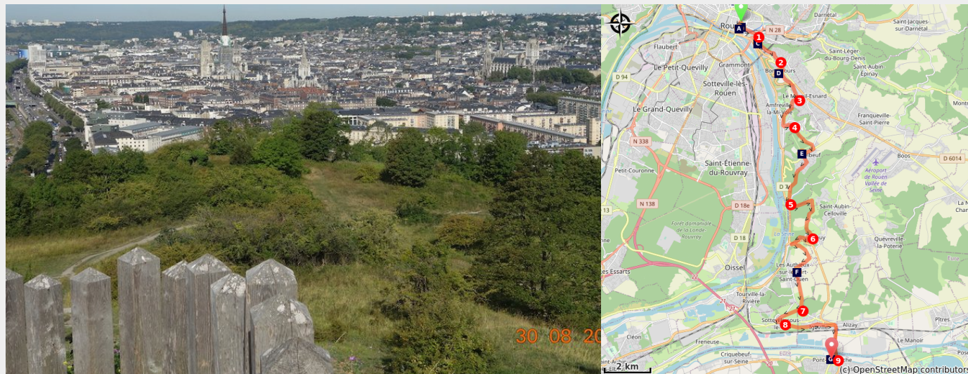
Vue panoramique de Rouen depuis la colline Sainte-Catherine sur la via Columbani (Association Colomban en Brie)