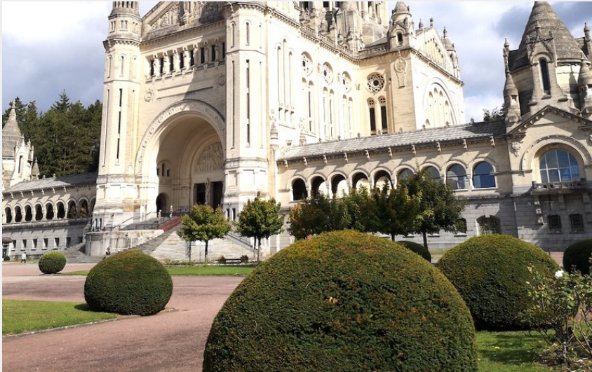
Basilique Sainte-Thérèse à Lisieux (Amis saint Colomban)