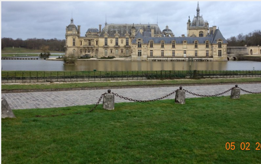
Château de Chantilly (Association Colomban en Brie)