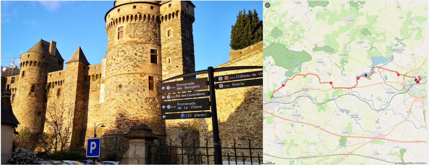
Le Château de Vitré (Amis saint Colomban)

A walk in a bocage with the charm of a lake and the castle of Vitré.