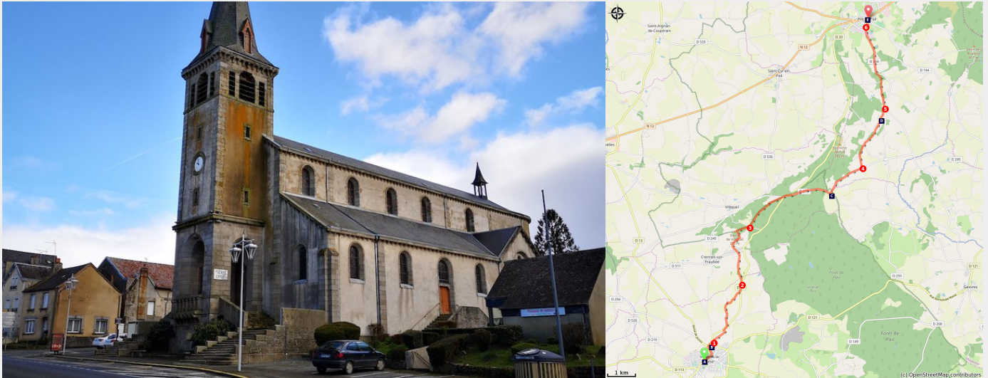
Église Sainte-Thérèse à Pré-en-Pail (Amis saint Colomban)

A day to cross cultures, forests and meeting a rural heritage.