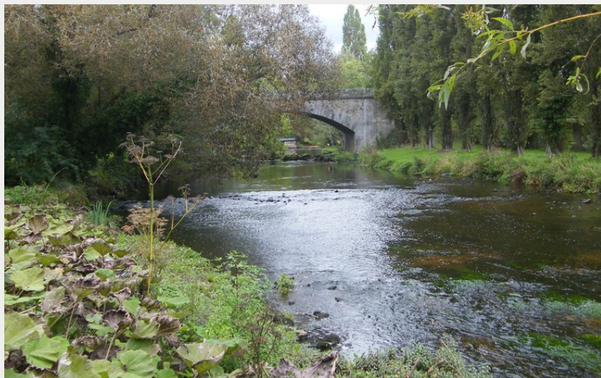
Le Scorff