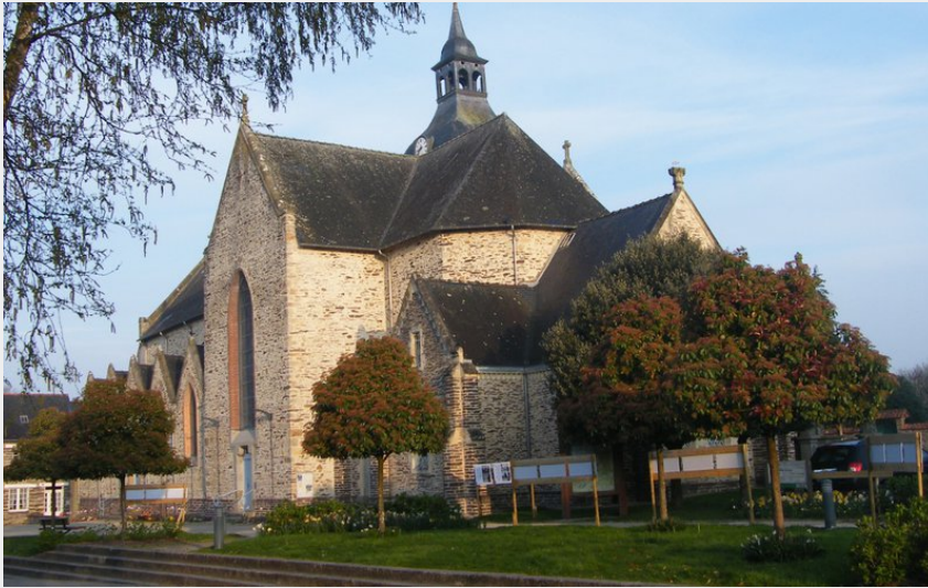
Eglise de Plélan le Grand (Amis Bretons de Colomban)