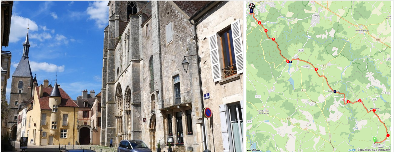
Façade de l'église Saint-Lazare et la Tour de l'Horloge (Amis saint Colomban)

Like the previous stages, the landscapes of the Morvan follow one another, alternating with forests, meadows and ponds.