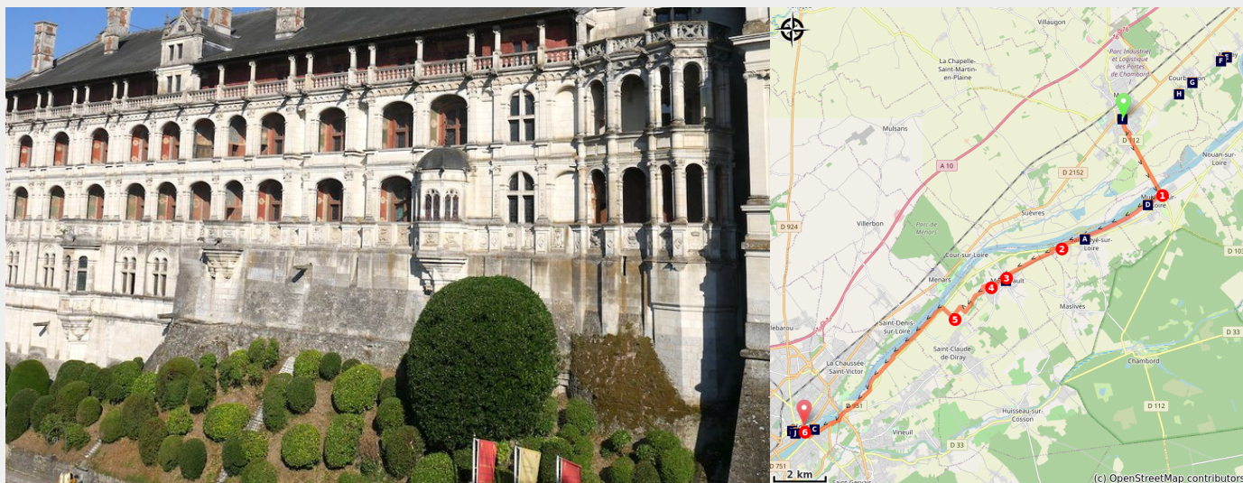
Château royal de Blois (Amis saint Colomban)

A stopover between Beauce and Sologne on the left bank of the Loire with the discovery of a rich heritage.