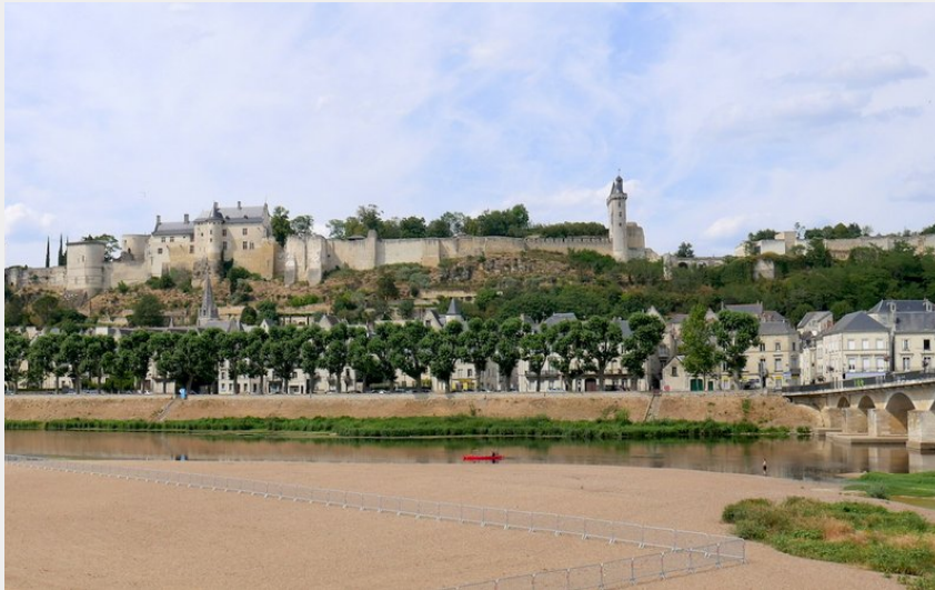
Vue générale de Chinon (Amis saint Colomban)