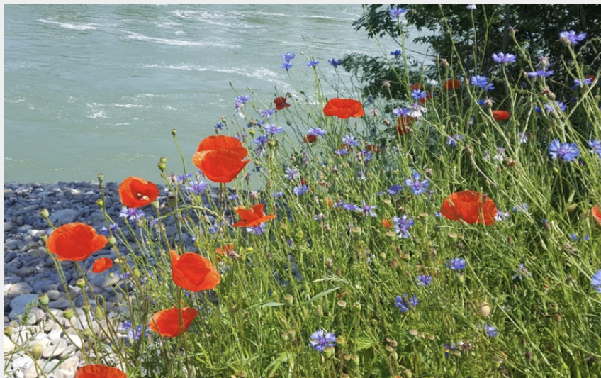
Rhin (Amis St Colombran)